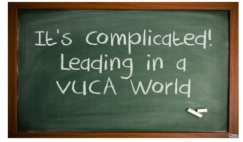
It's Complicated: Leading in a VUCA World